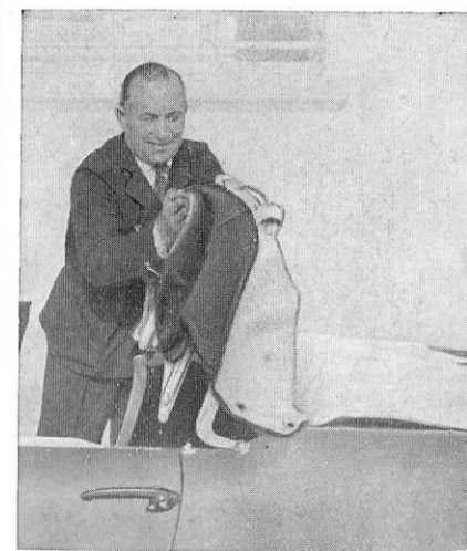
Fig. 60. - Raise the canvas hood.