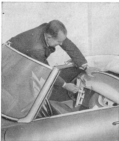
Fig. 63. - Secure the canvas hood the car by means of the belts provided.