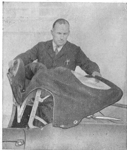
Fig. 57. - Release the rear cross-member.