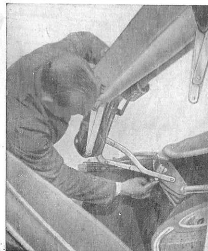
Fig. 61. - Disengage the lower arms (disengagement occurs as the hood is lifted).