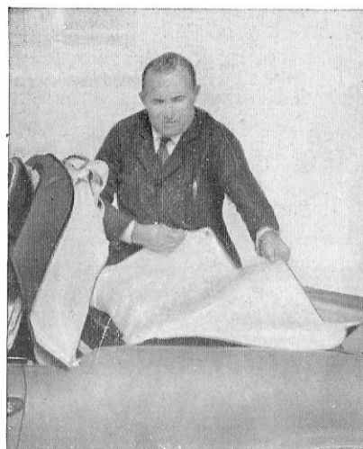
Fig. 59. - Take out the cover cloth and lay it on the car.