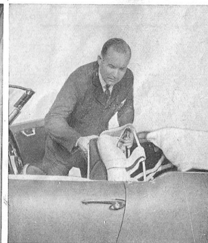
Fig. 62. - Lower the hood into the space provided.