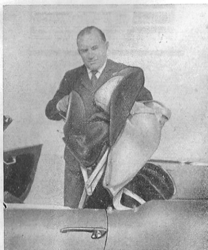
Fig. 58. - Bring the rear cross-member over the intermediate arches, taking care that the window is folded over itself and laid between the fabric folds of the arches in question. The plastic window must not be left in contact with the rubber strip on the rear cross-member, or the rubber may mark the window.