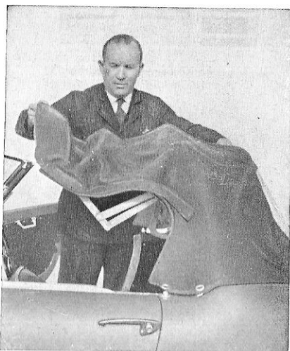
Fig. 56. - Gather up the canvas hood.